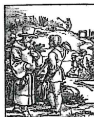
Evangelium am Sonntag Septuagesima, Matthäus 17.

Septuagesima (/ˌsɛptjuəˈdʒɛsɪmə/) comes from the Latin word for "seventieth." It is the ninth Sunday before Easter, the third before Ash Wednesday. The term is sometimes applied to the seventy days starting on Septuagesima Sunday and ending on the Saturday after Easter. The 17-day period beginning on Septuagesima Sunday was intended to be observed as a preparation for the season of Lent, which is itself a period of spiritual preparation (for Easter).